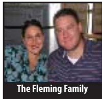
The Fleming Family

www.HelpingFloridaHomeowners.com FORECLOSURE AND SHORT SALE ANSWERS